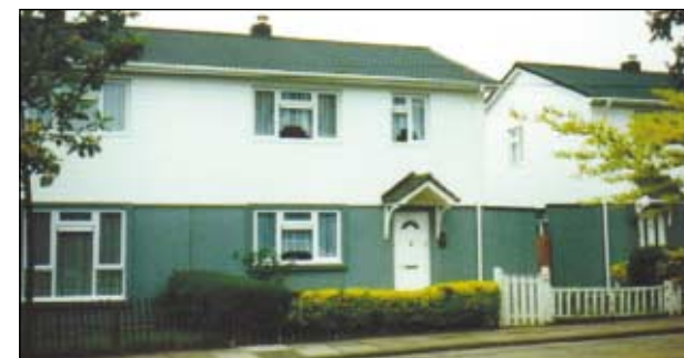
The Pantile 2000 fast-track roofing system considerably reduces time on site, keeping disturbance to a minimum.