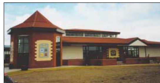
Pantile 2000 ridge to eaves sheets are BBA approved for roof pitches as low as 5 degrees.