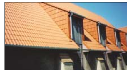
As well as providing individually tailored sheet lengths to suit each project. Britmet Tileform can provide special flashings for application requirements.