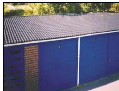
The rigidity of the Pantile 2000 lightweight sheets permit direct fixing to reinforced concrete purlins with no additional support required.