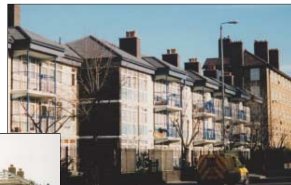
The Pantile 2000 fast-track roofing system considerably reduces time on site, keeping disturbance to a minimum.