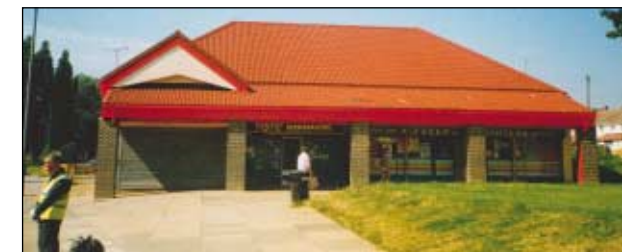
Boldroll ridge to eaves tile effect roofing sheets offer improved structural integrity over traditional materials, making them a popular choice for areas with high levels of vandalism.