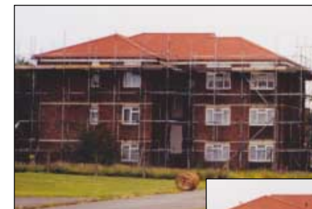
The Boldroll system can be trimmed to fit any irregular design with ease.