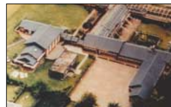
The Boldroll ridge to eaves roofing system can be used on projects where the weight of traditional materials is too great.