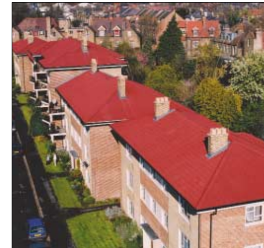
Boldroll ridge to eaves sheets can be fixed to a steel sub-structure as in this flat to pitched roof conversion.