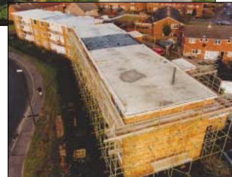
Boldrolls fast-track roofing system considerably reduces time on site, keeping disturbance to a minimum.