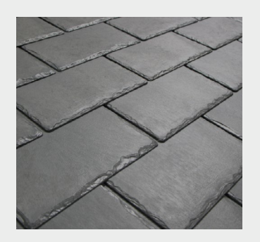
LiteSlate Recycled Composite Slate