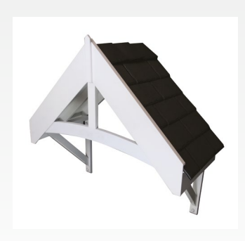
Door Canopies Customisable Door Coverings