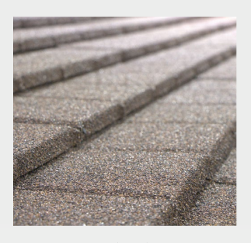
Plaintile Granulated Metal Roof Tile