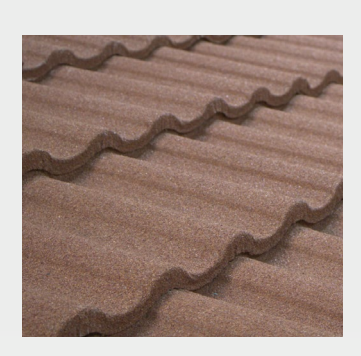
Villatile Granulated Metal Roof Tile