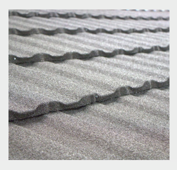
Profile 49 Granulated Metal Roof Tile