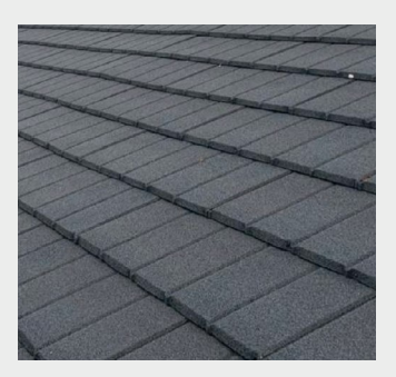
Slate 2000 Granulated Metal Roof Tile