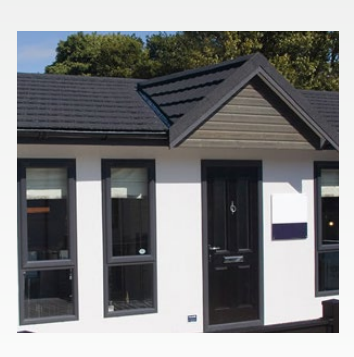
Paint Stipple and Masonry Paint