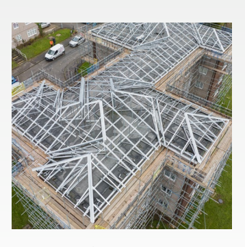
BritFrame Flat-to-Pitch Roof Conversion System