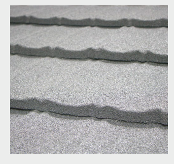
Ultratile Granulated Metal Roof Tile