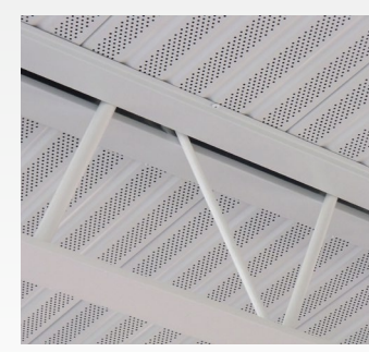
Tactray 90 Structural Liner Tray