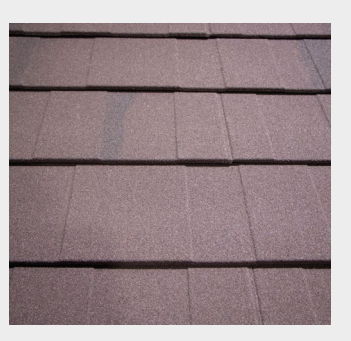
Shingle Granulated Metal Roof Tile