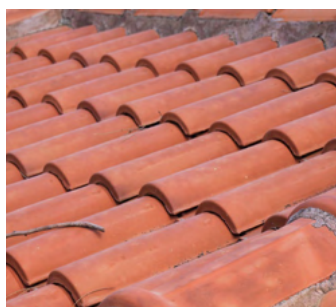
Clay + Concrete Tiles